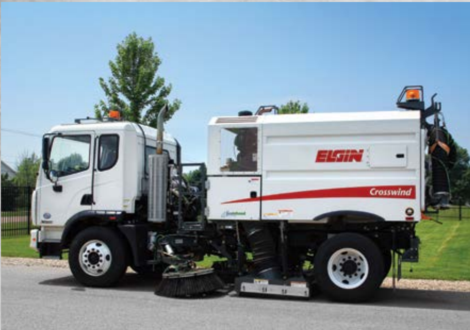
The Elgin Crosswind sweeper now cleans city streets with a PowerTech EWX 4.5L Final Tier 4/Stage IV engine.