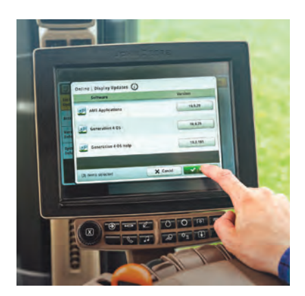
TECHNOLOGY & PERFORMANCE UPGRADES: Add the latest technology of universal displays, AutoTrac™,Greenstar™ and more to your John Deere equipment and take your operation to the next level.