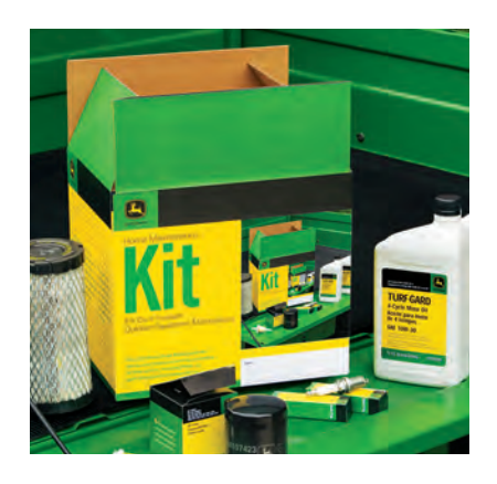
PARTS: Your John Deere dealer offers quality OEM Parts designed to maximize performance and reduce downtime.

There's no time for downtime when you need to be in the field. Count on your John Deere dealer for solutions and support and your Multi-Use Account for a dependable line of credit season after season.