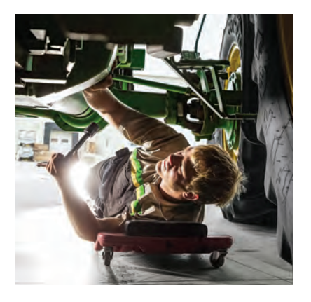
SERVICE: Pre- and post-season inspections keep your equipment running like new and catch small problems before they become costly repairs.