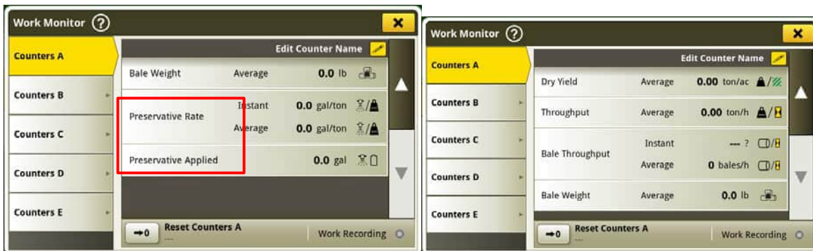
Visible vs. Hidden