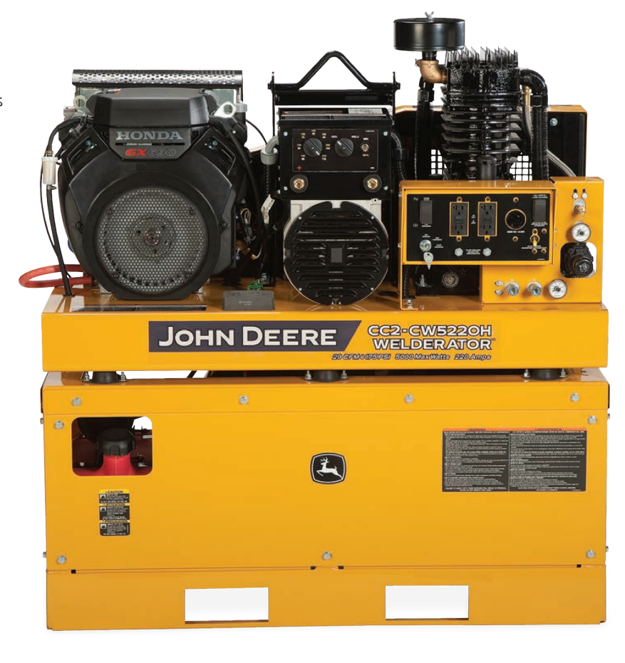
(1) NEMA L14-20