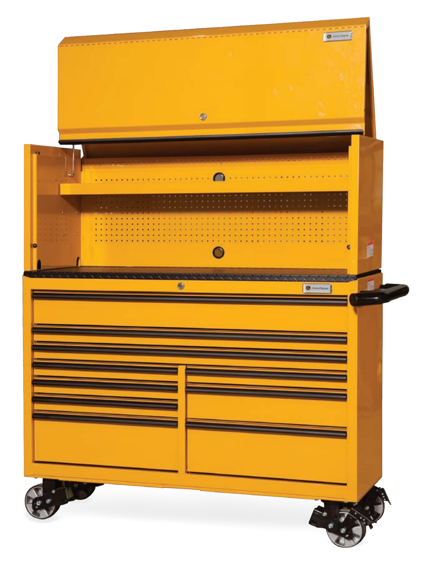
CC-5624H-Y and CC-5624CB-Y, 56-in. Top Hutch and Cabinet shown stacked