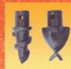
Choice of standard or fish-tail points.