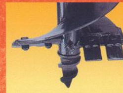
Replaceable knives and point.

Available options include: Storage stand Positioning handle for models PHD200, PHD 300, & PHD400 Hydraulic downforce kit for models PHD200, PHD 300, & PHD400