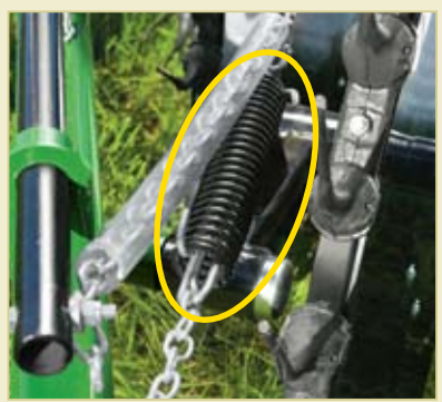
A torsional dampening spring (highlighted) allows the rake wheels to float more freely for smoother raking.