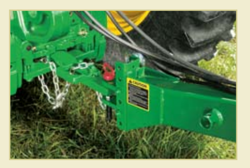
Standard clevis hitch lets you set the rake to the height of the tractor's drawbar, which helps you maintain a level frame for equal ground pressure. The safety tow chain comes standard.