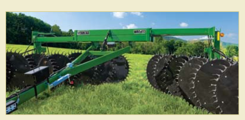
The WR5417 offers a maximum raking width of 29 feet for wider coverage. Or if your operation calls for one-sided raking, the rake wheel beams can be angled independently to the desired position. Hydraulically adjust your windrow width from 24 inches to 72 inches from the seat of your tractor.

When working in gusty conditions or light hay, the wind panels (left) minimize crop loss through the rake wheels, and prevent hay from wrapping around the wheel hub. 60-inch rake wheels help to increase efficiency, and rubber-mounted teeth (right) are designed to handle your crop with care.