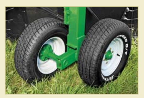
Tandem wheels provide smooth level raking when working over uneven terrain and contours.

The rake beams on the Frontier Heavy-Duty Wheel Rake feature variable adjustment for setting the wheel straight or tilted based on an 8-degree of difference. Decrease angle to minimize debris pickup, or increase angle when gathering wet hay. Use the ratchet handle ( highlighted ) to adjust tilt angle. The handy meter lets you know when you're at your desired angle.