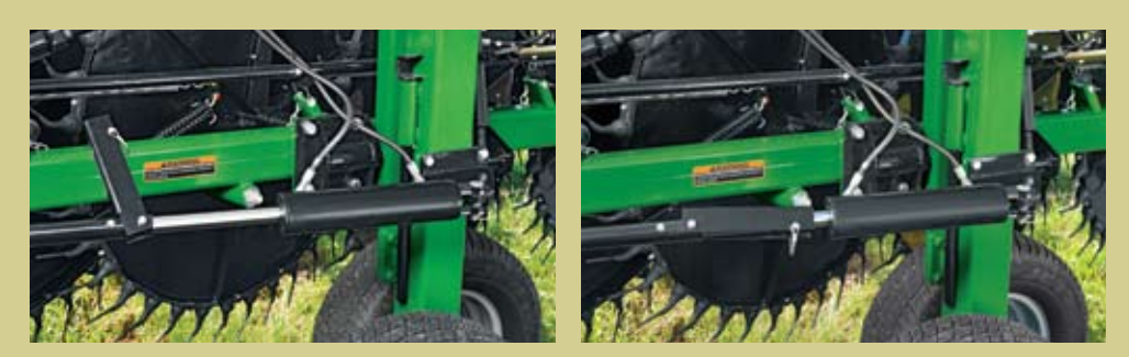
The rake beams on the WR5417 can be locked for easy transport and storage.

Make a variety of rake adjustments – like windrow or transport width – all from your tractor seat by using just one hydraulic remote ( not shown ) to activate the switches on the rake's electric control box ( left ). The control box connects to the rake's hydraulic valve bank to activate all of the cylinders ( right ).