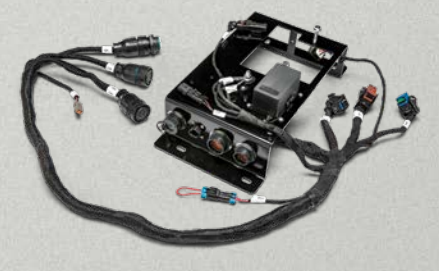
DZ110508 Engine to ECU Interconnect Harness Kit, 1 m (3 ft)