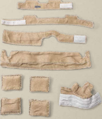
RE567315 Insulation Blanket Kit