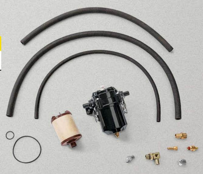
RE532962 Closed Crankcase Ventilation Kit