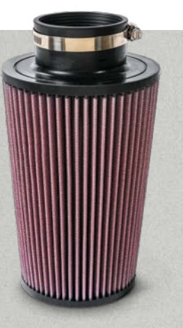
RE528296 Washable Air Filter

Matched to your engine's airflow needs, John Deere washable air filters ensure your engine is getting adequate clean air for maximum performance and long service life. Filters are easily cleaned with power sprayers or commercial parts washers.