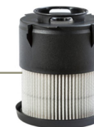
HYDRAULIC OIL FILTER - RE197065 Replace initially after 100 hours and after every 600 hours.

Replace initially after 300 hours for models 5225 and 5325. Replace initially after 100 hours for models 5425, 5525 and 5625. Service interval can be extended to 450 hours if John Deere PLUS-50 oil and John Deere filter are used.