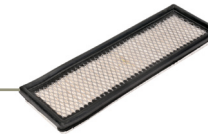
CAB RECIRCULATION AIR FILTER - RE195491

Clean after every 300 hours and replace as per filter condition.