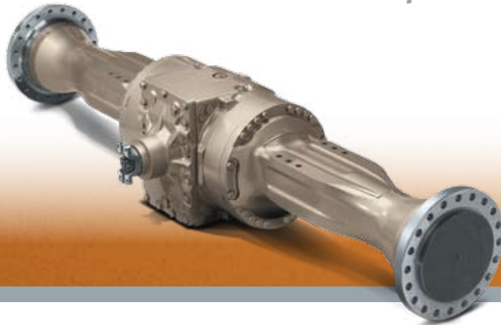
1400 SWEDA™ axle shown