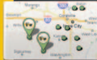
Maps: Current location, location history, and driving directions