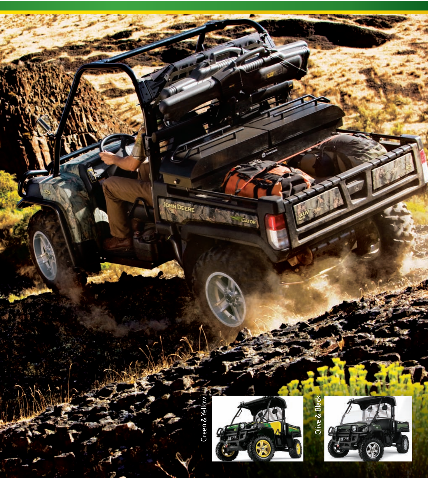
Green & Yellow