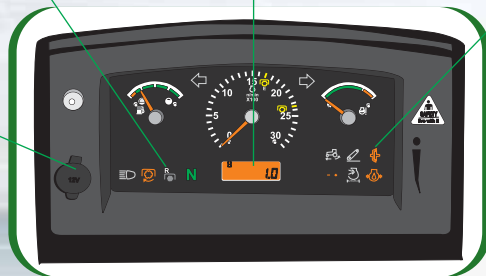
MFD Multi Function Display

...The new generation of Smart tractors is here!