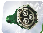
Planetary Gear with Straight Axle