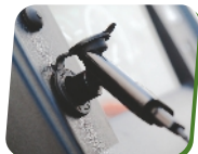
Mobile Charging Point with Holder