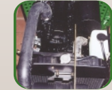
Radiator with Overflow Reservoir