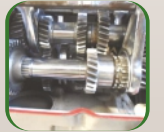
Top Shaft Lubrication