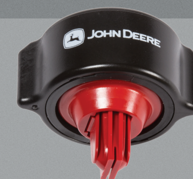
Ultra Low-Drift Max (ULDM)