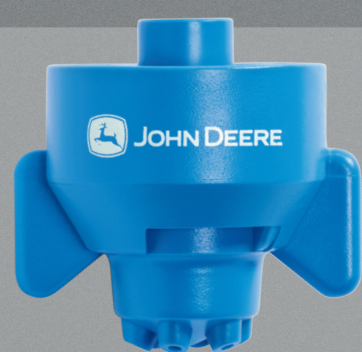
Straight Stream Ceramic (SSC)