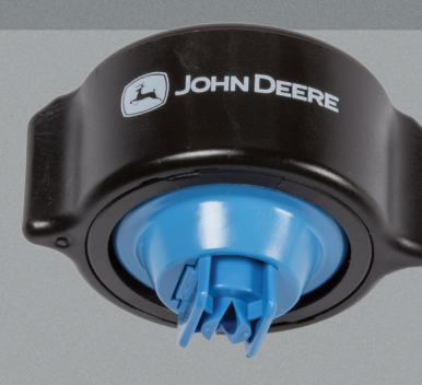
Low-Drift Max (LDM)