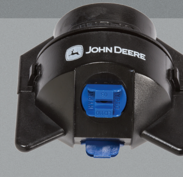
Low-Drift Twin (LDT)