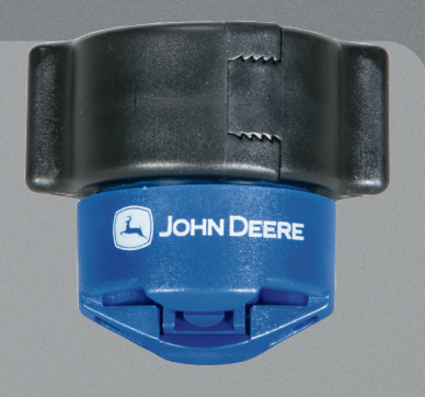
GuardianAIR Twin (GAT)

Improve Plant Health with spot-on coverage from every angle