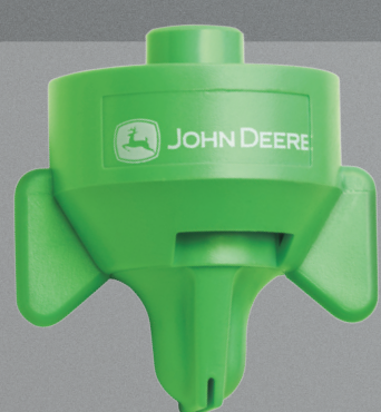
High Flow (HF)